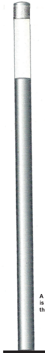
A hand hold and cover is provided at 18" above the bottom of the shaft.