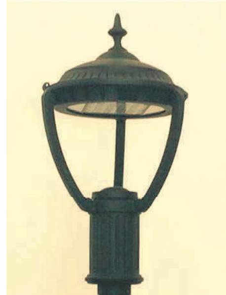
San Tropez shown with 3 convex scrolls